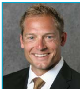
2015: Western Michigan P.J. Fleck