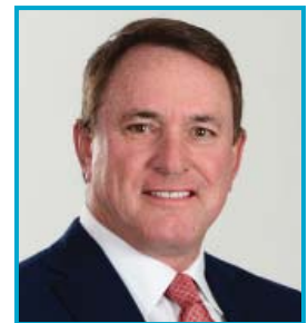
2018: FIU Butch Davis