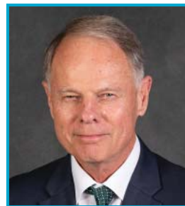
2017: Ohio Frank Solich