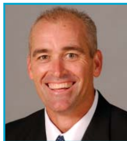
2016: Old Dominion Bobby Wilder